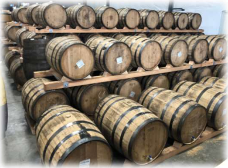
All three layers of Doc Swinson's Solera Pyramids